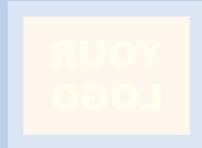
BACK view of DTF label